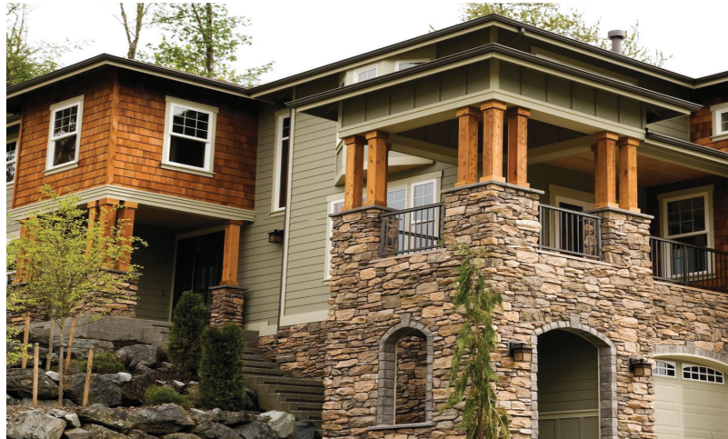
Exceptional NEW Fix & Flip Family Home